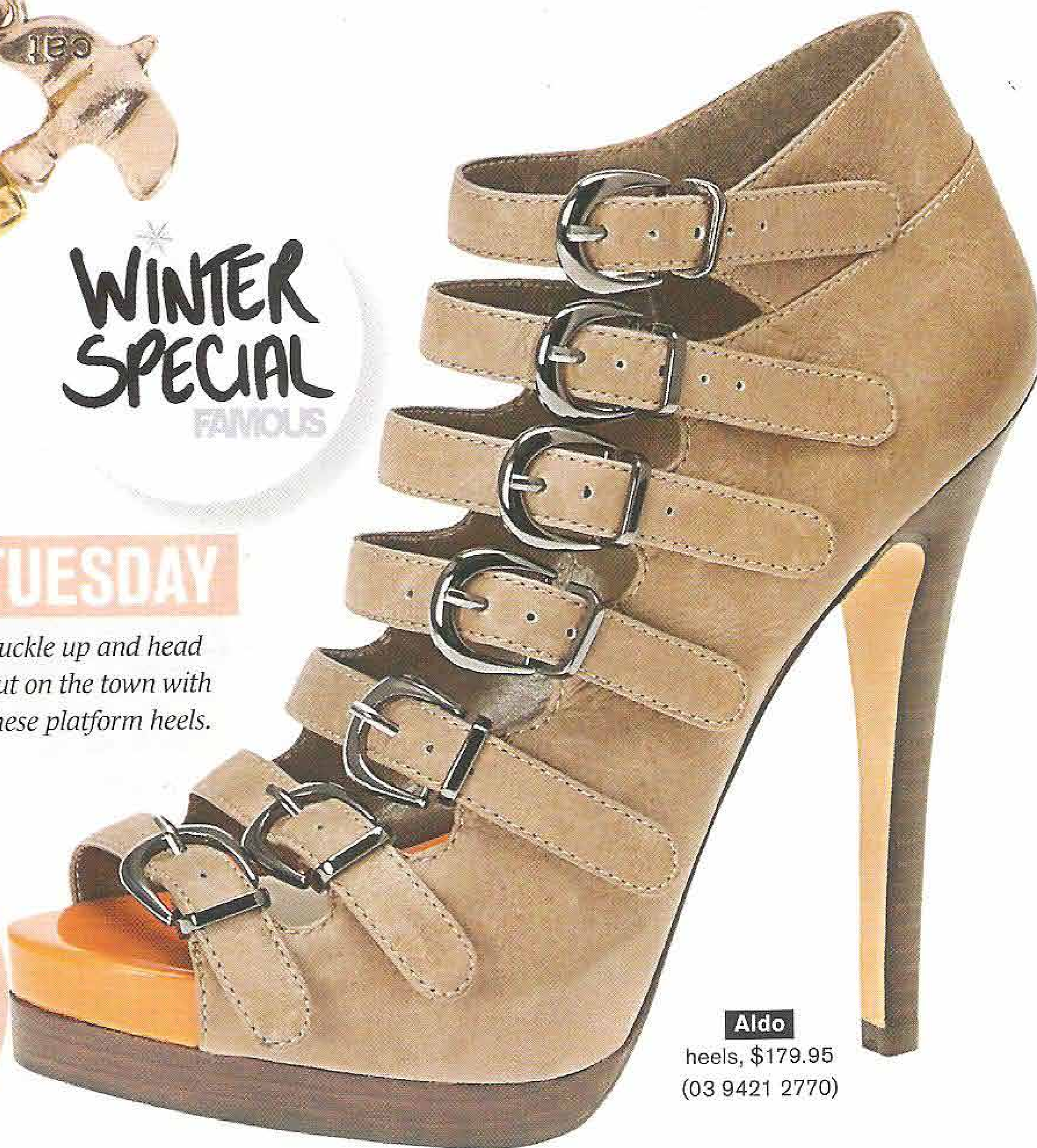
Aldo heels, $179.95 (03 9421 2770)

Buckle up and head out on the town with these platform heels.