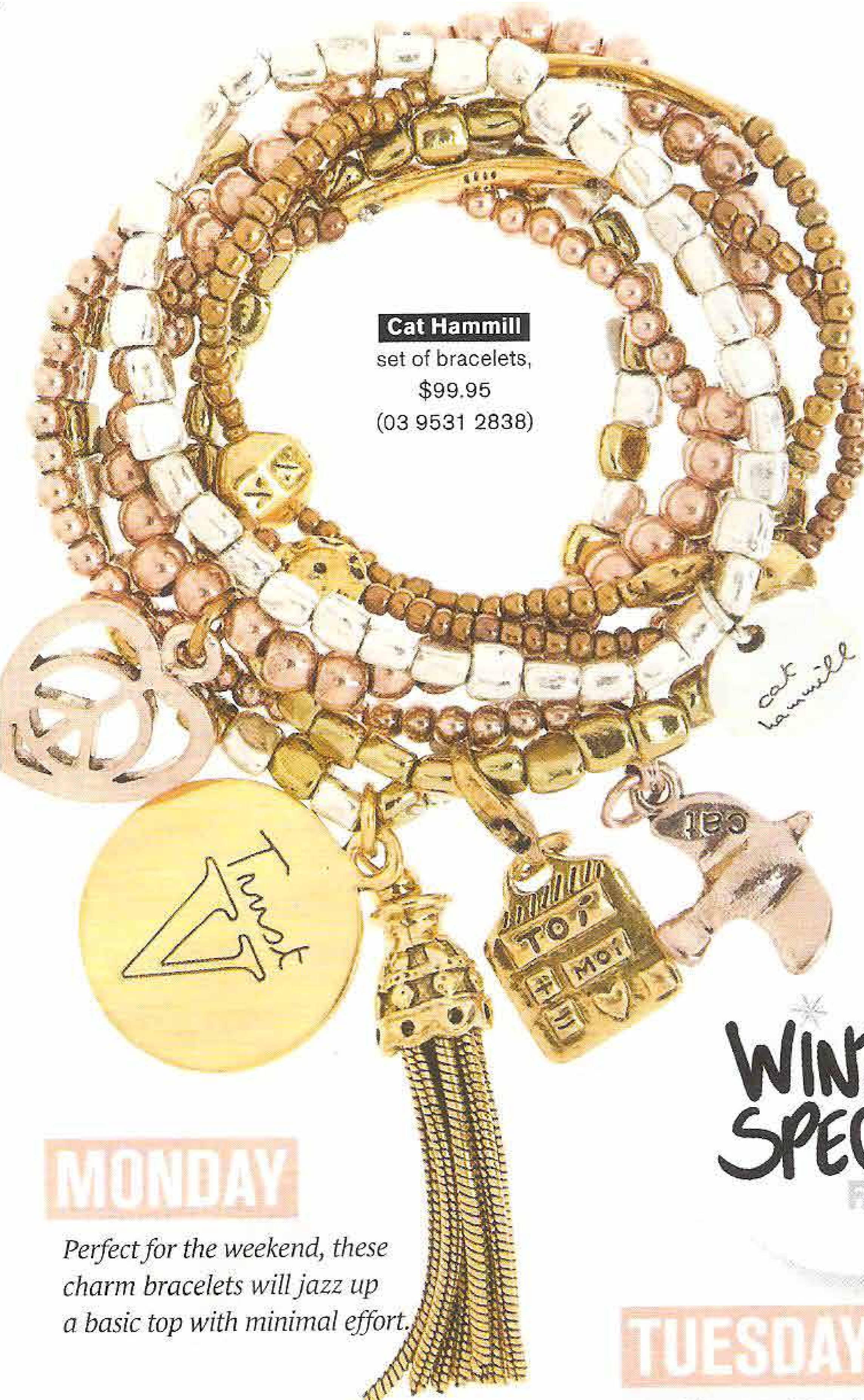
Cat Hammill set of bracelets, $99.95 (03 9531 2838)

THE HOTTEST THINGS YOU'VE GOTTA HAVE TO SURVIVE THE NEXT SEVEN DAYS IN STYLE.