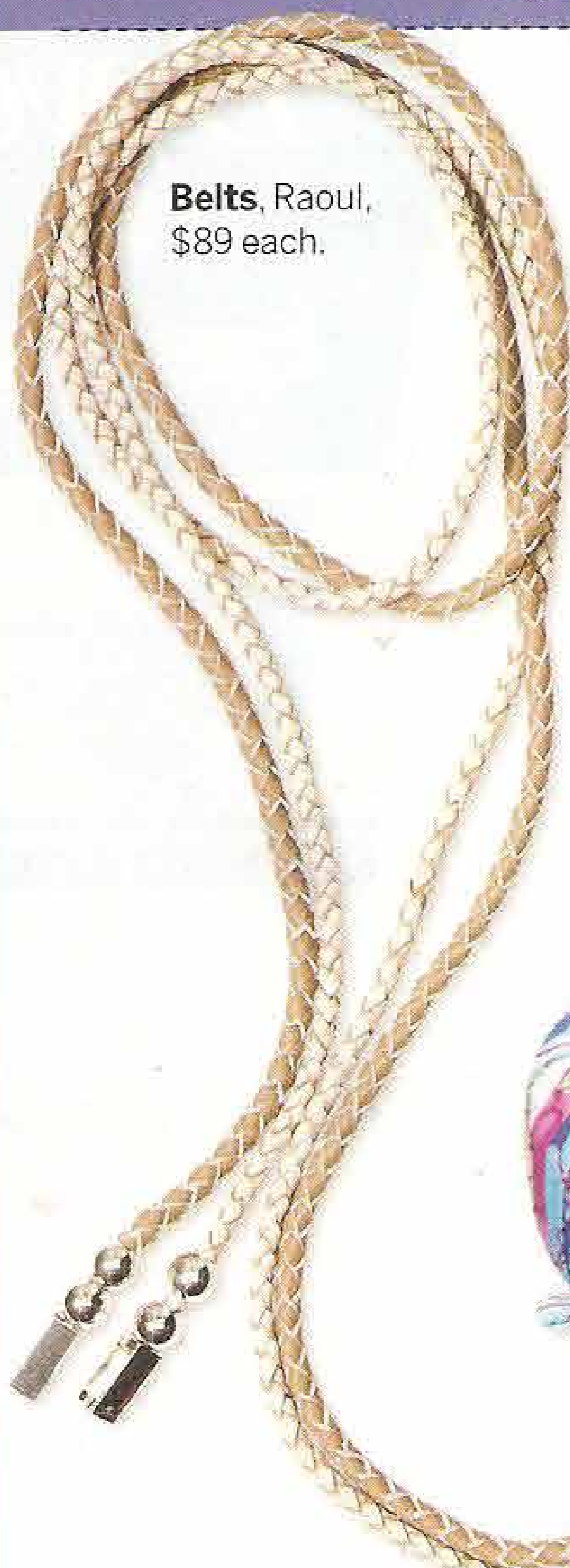
Belts, Raoul, $89 each.