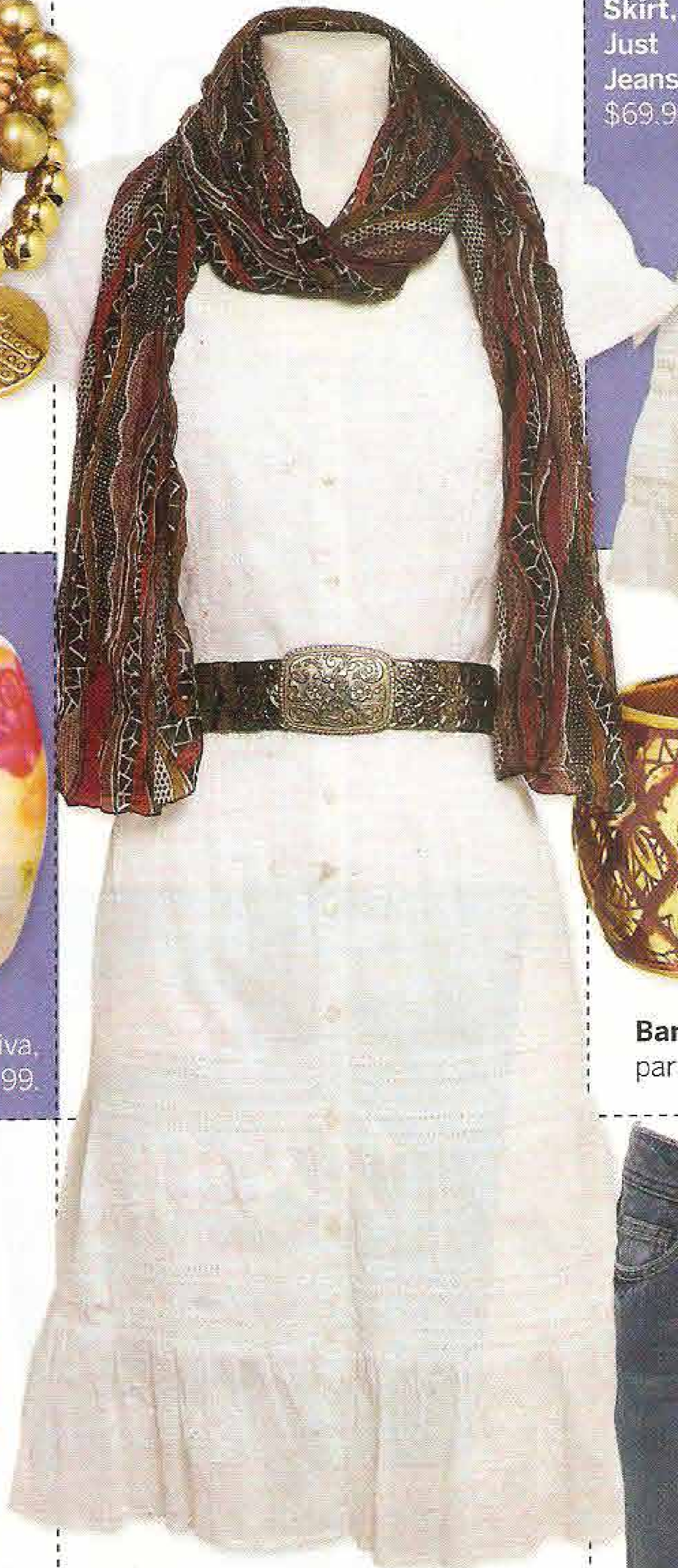
Dress, Just Jeans, $79.95. Scarf, Jacqui E, $29.95.