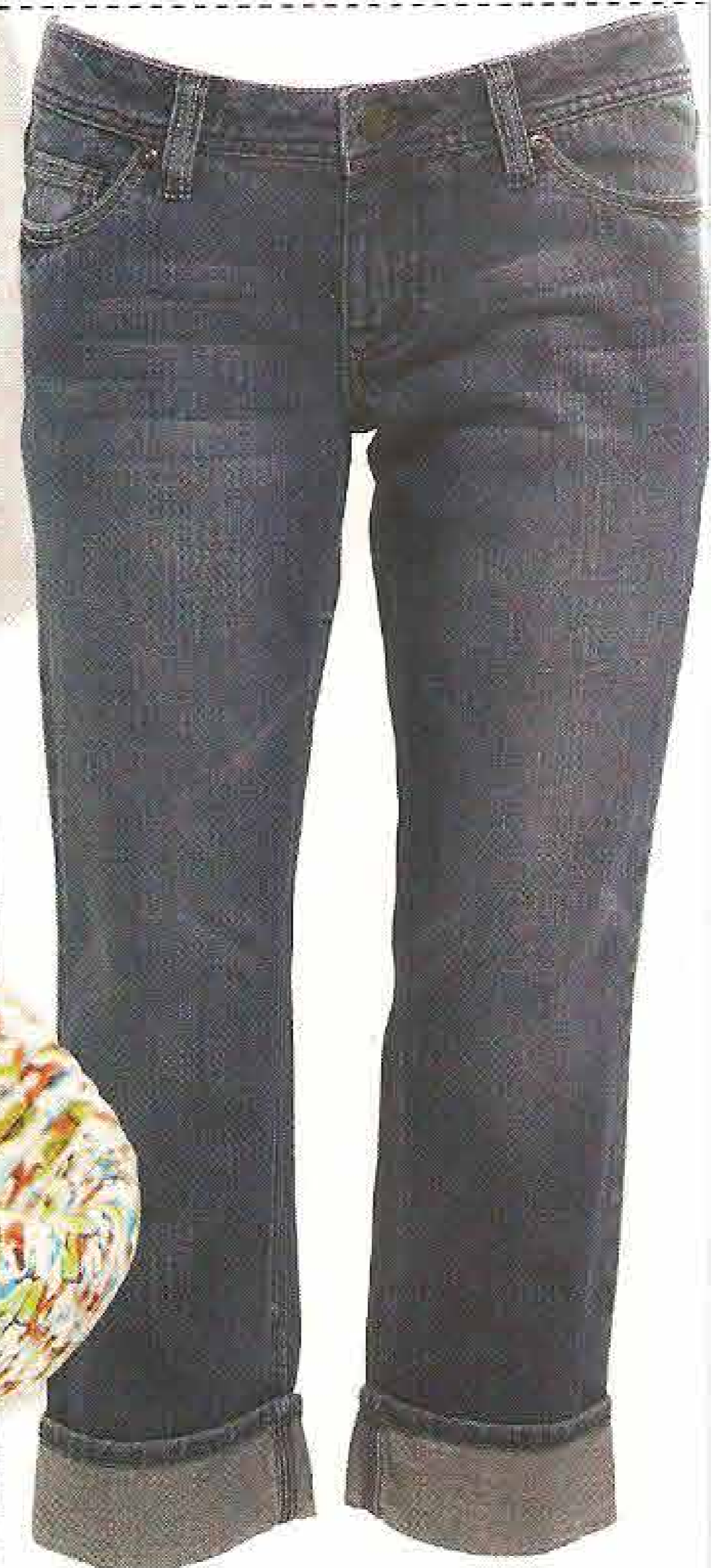
Jeans, Just Jeans, $79.95.