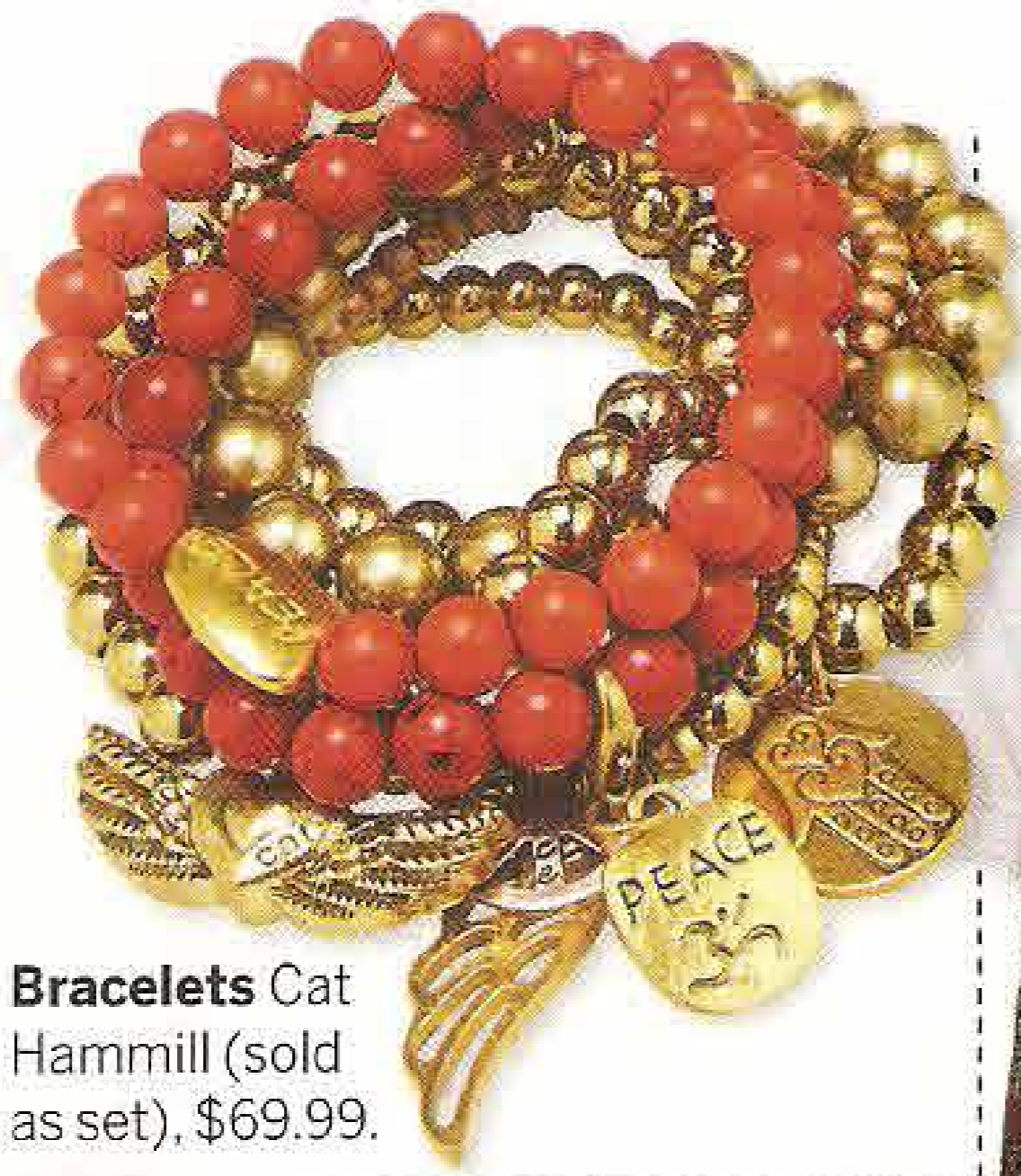
Bracelets Cat Hammill (sold as set), $69.99.