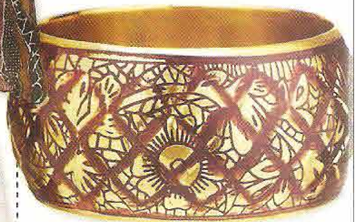
Bangle, Diva (sold as part of a set), $19.99.