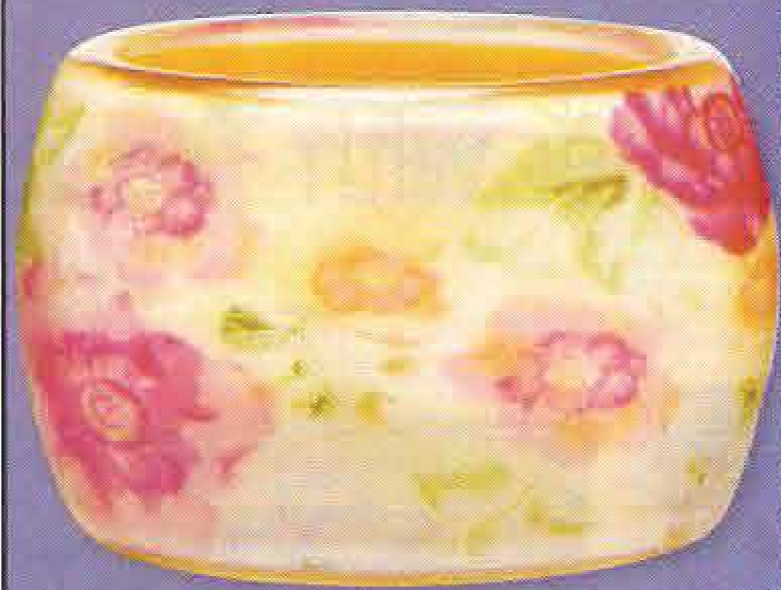
Bangle. Diva, $24.99.