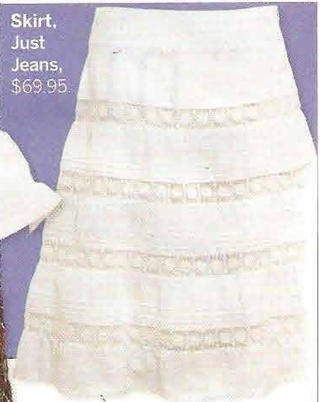
Skirt, Just Jeans, $69.95.